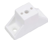
60285012 1" (25mm) spacer

Min. interior depth required: 11" (280 mm)